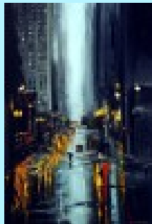
"The Lights That Shine" by Ruslana Levandovska

"This piece shows the resilience of the temporarily ghost-like city that is the effect of COVID-19, giving new character to our beloved streets. But it is sure to return in strength!"